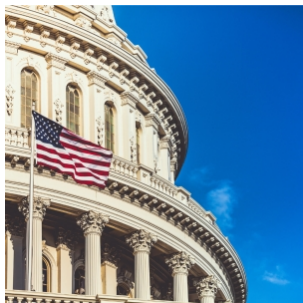
The $2 trillion emergency relief package represents a bipartisan effort intended to assist individuals and businesses during the ongoing coronavirus pandemic and accompanying economic crisis.